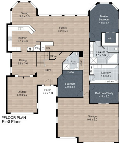
//FLOOR PLAN First Floor