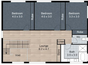
//FLOOR PLAN Second Floor