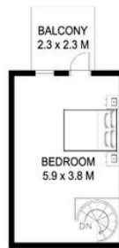
STUDIO UPPER LEVEL