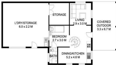
STUDIO LOWER LEVEL