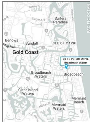
● Location Map

Freshwater Point Residence 1504/33 T E PETERS DRIVE ● Broadbeach Waters