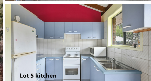
Lot 5 kitchen