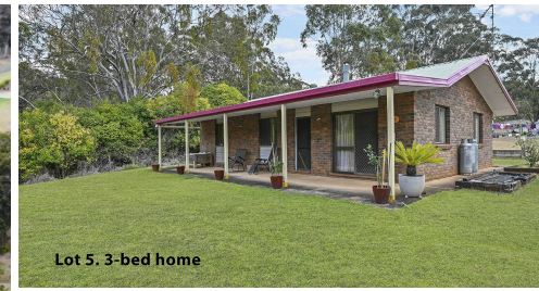
Lot 5. 3-bed home