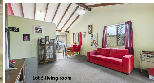
Lot 5 living room