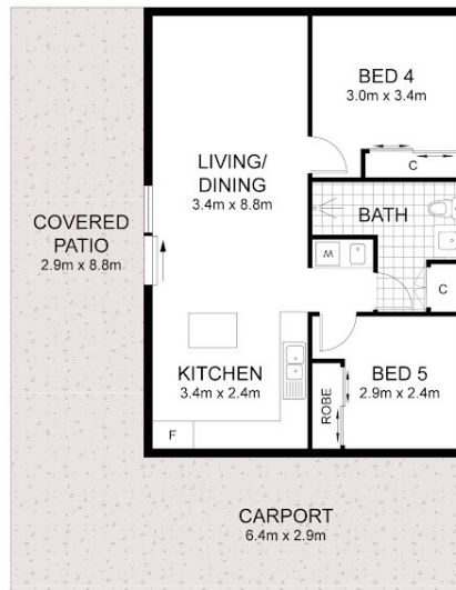
Self contained unit