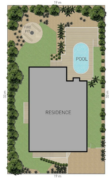
BEACH AVENUE SITE PLAN