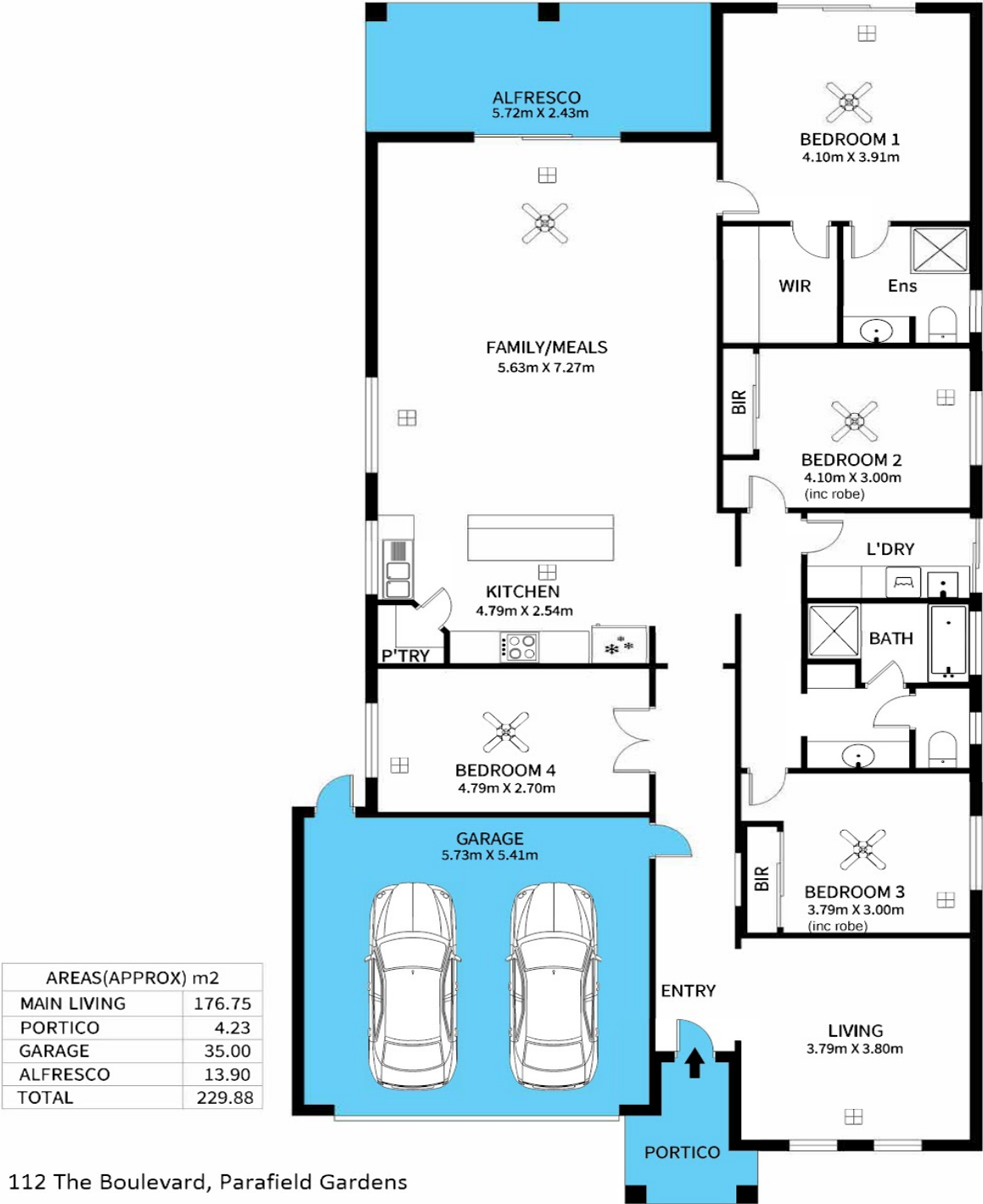
112 The Boulevard, Parafield Gardens

Disclaimer: This drawing is for illustration purposes only. All measurements are approximate. Details intended to be relied upon should be independently verified.