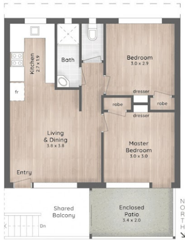
:: FLOOR PLAN Level 1 - 2.6m Ceiling