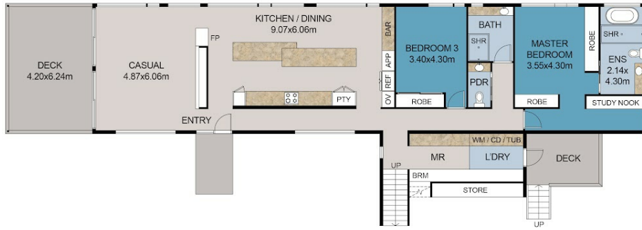
LOWER GROUND FLOOR PLAN