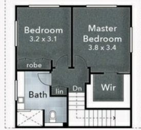
// FLOOR PLAN First Floor