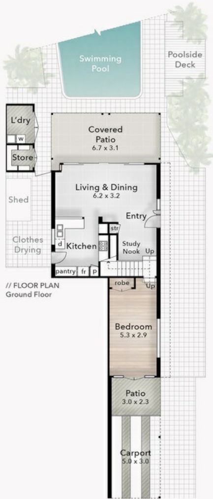
// FLOOR PLAN Ground Floor