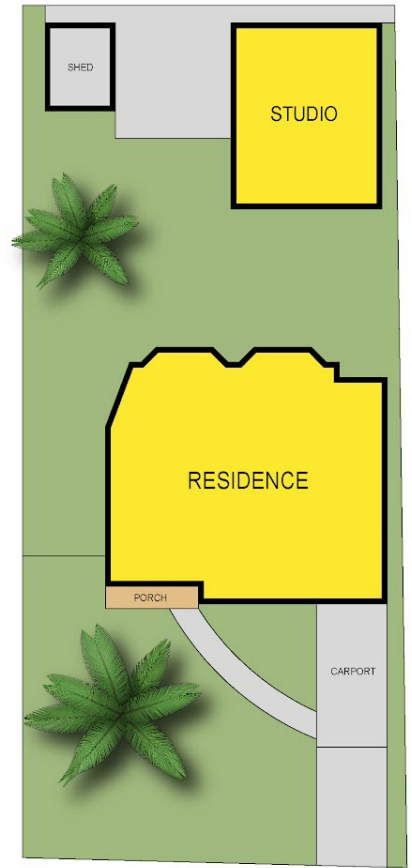
SITE PLAN : 575.4sqm