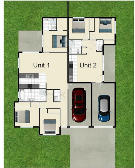
Site Plan (not to scale)