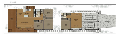
10 ADELAIDE STREET, KINGSTON SCALE: 1:100 @ A3