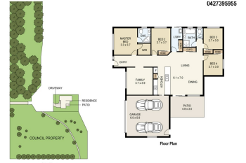
6 MALLARD CLOSE, EAGLEBY