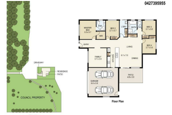
6 MALLARD CLOSE, EAGLEBY