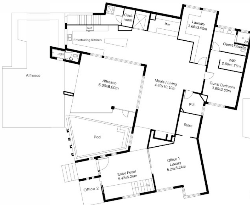
GROUND LEVEL FLOOR PLAN