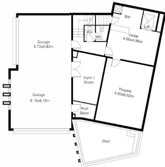
LOWER GROUND LEVEL FLOOR PLAN