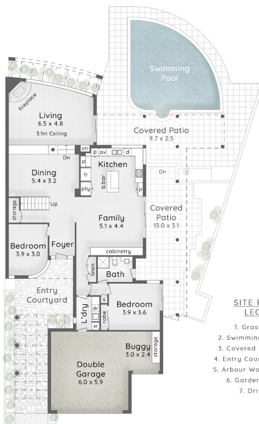
:: FLOOR PLAN Ground Floor 2.7m Ceiling