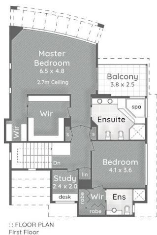
:: FLOOR PLAN First Floor