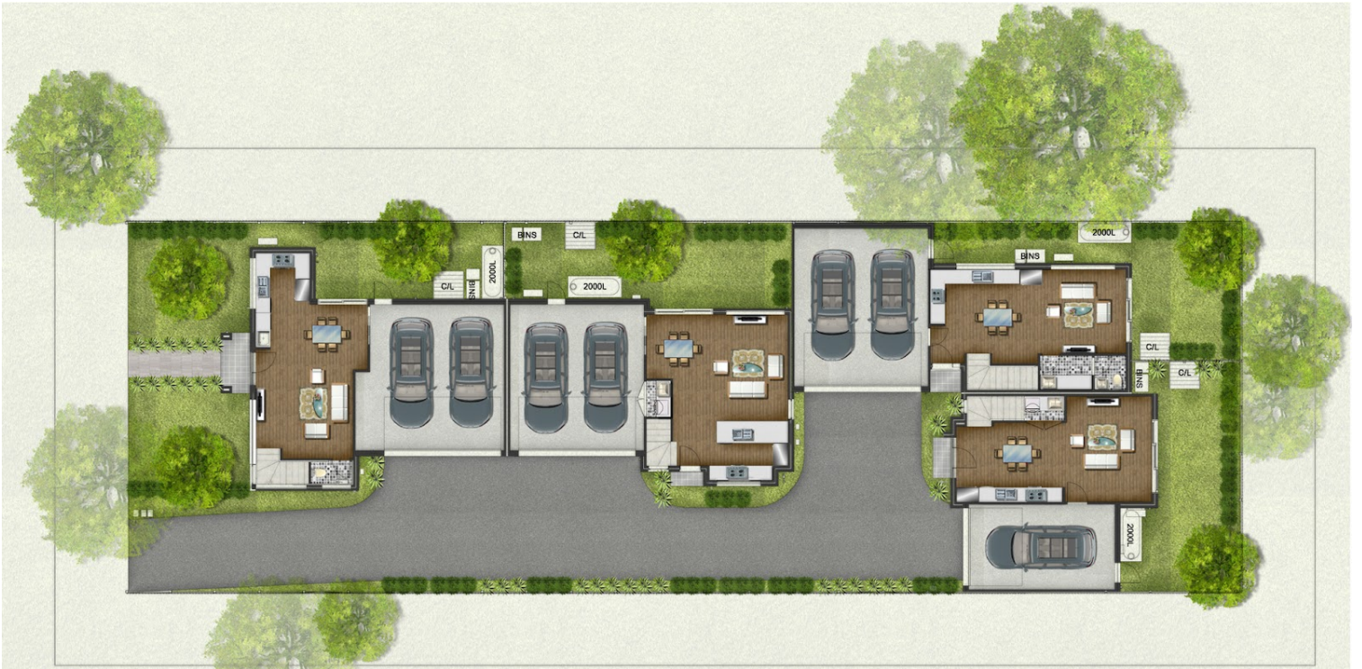
OVERALL GROUND FLOOR