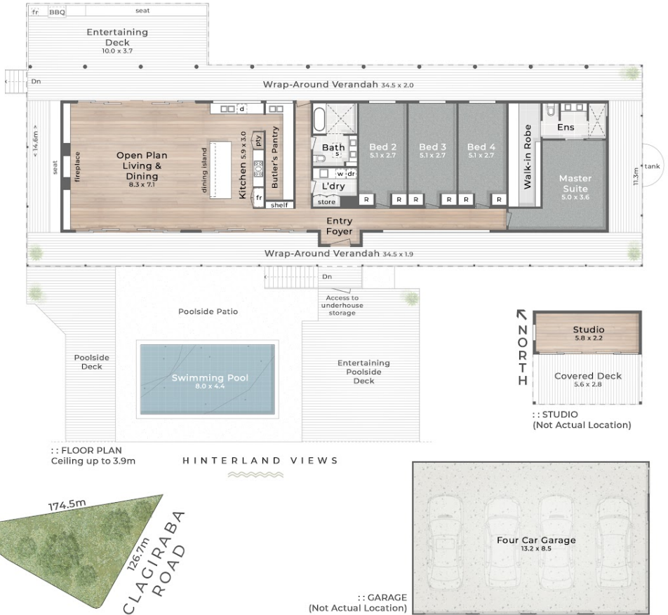
:: FLOOR PLAN Ceiling up to 3.9m