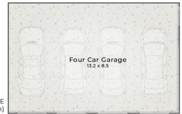
:: GARAGE (Not Actual Location)

3.15 Hectares or 7.78 Acres 4 Bed + Studio 2 Bath 8+ Car