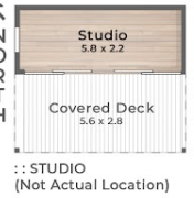
:: STUDIO (Not Actual Location)