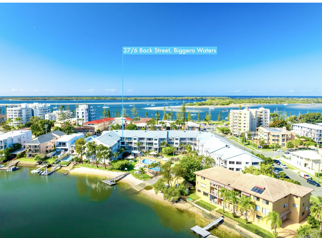
27/6 Back Street, Biggera Waters