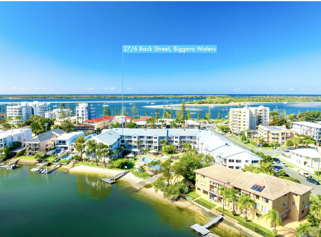
27/6 Back Street, Biggera Waters