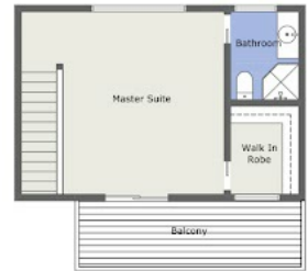
[ ] First Floor