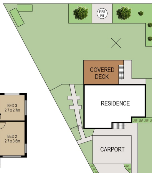
SITE MAP (NOT TO SCALE BELOW)