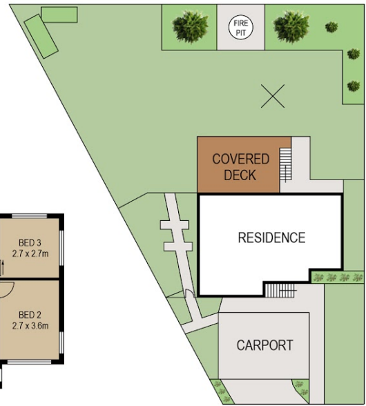
SITE MAP (NOT TO SCALE BELOW)