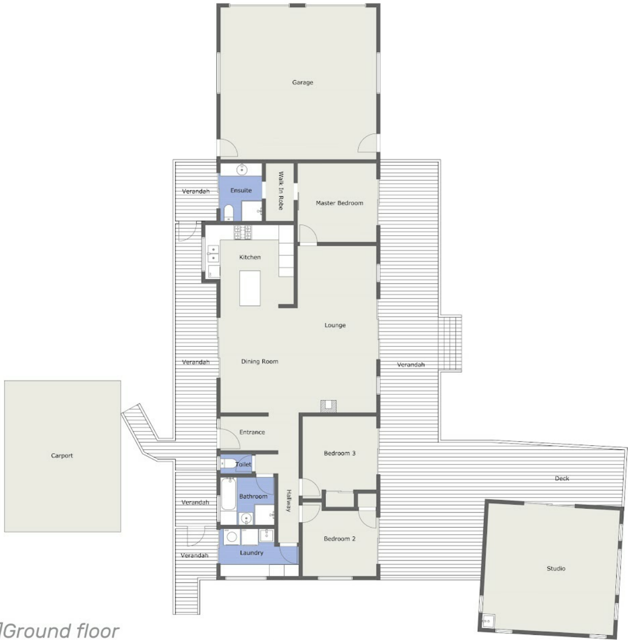
[ ] Ground floor