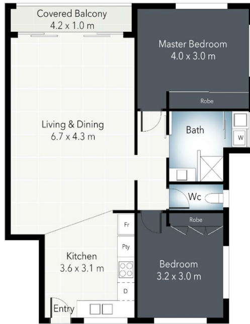
UNIT 3 FLOOR PLAN