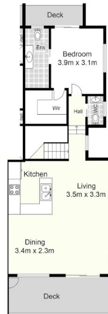
36 Hunter St, Stockton

All information contained herein is gathered from sources we deem reliable. However, we cannot guarantee its accuracy and act as a messenger only in passing on the details. Interested parties should rely on their own inquiries and the contract for sale. The floor plans are artist's impressions only. The site plan is not to scale.