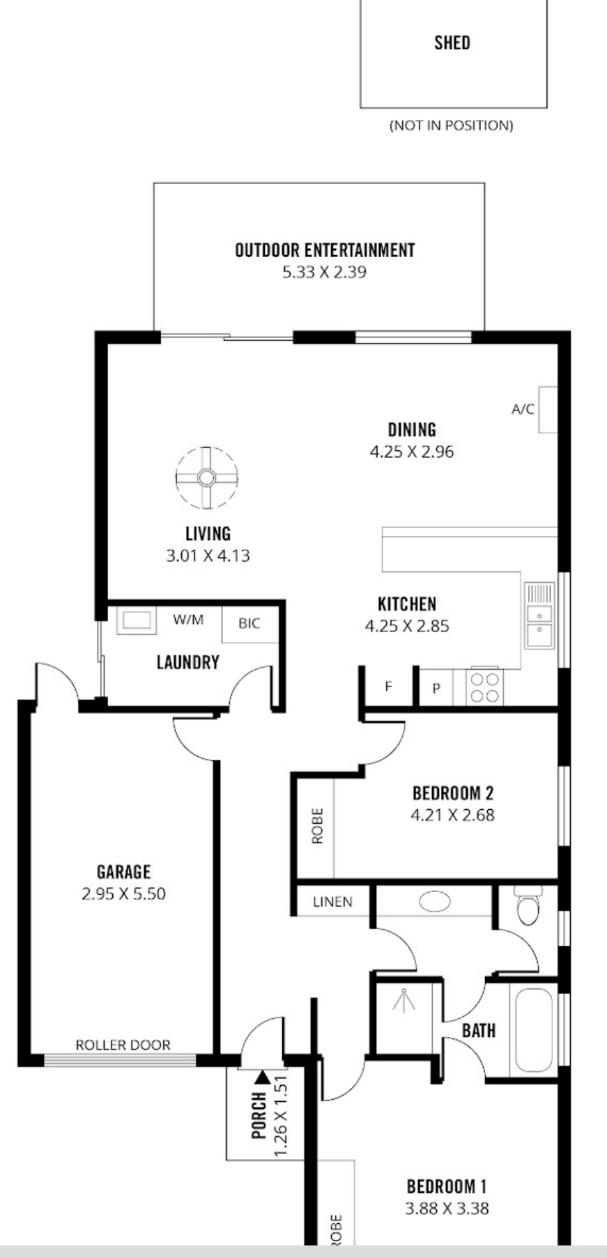
Disclaimer: Please note this floor plan is for marketing purposes and is to be used as a guide only. All dimensions are estimates only and may not be exact measurements.