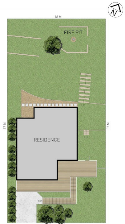
TOMBONDA ROAD SITE PLAN