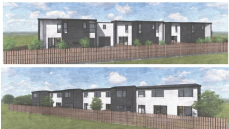
3 bedroom units concept