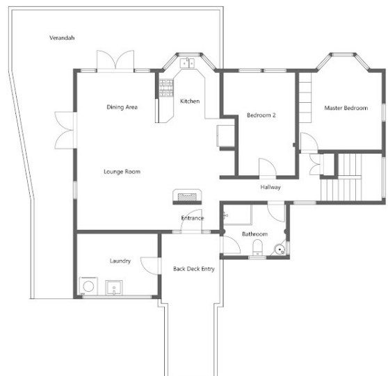
[ ]First floor