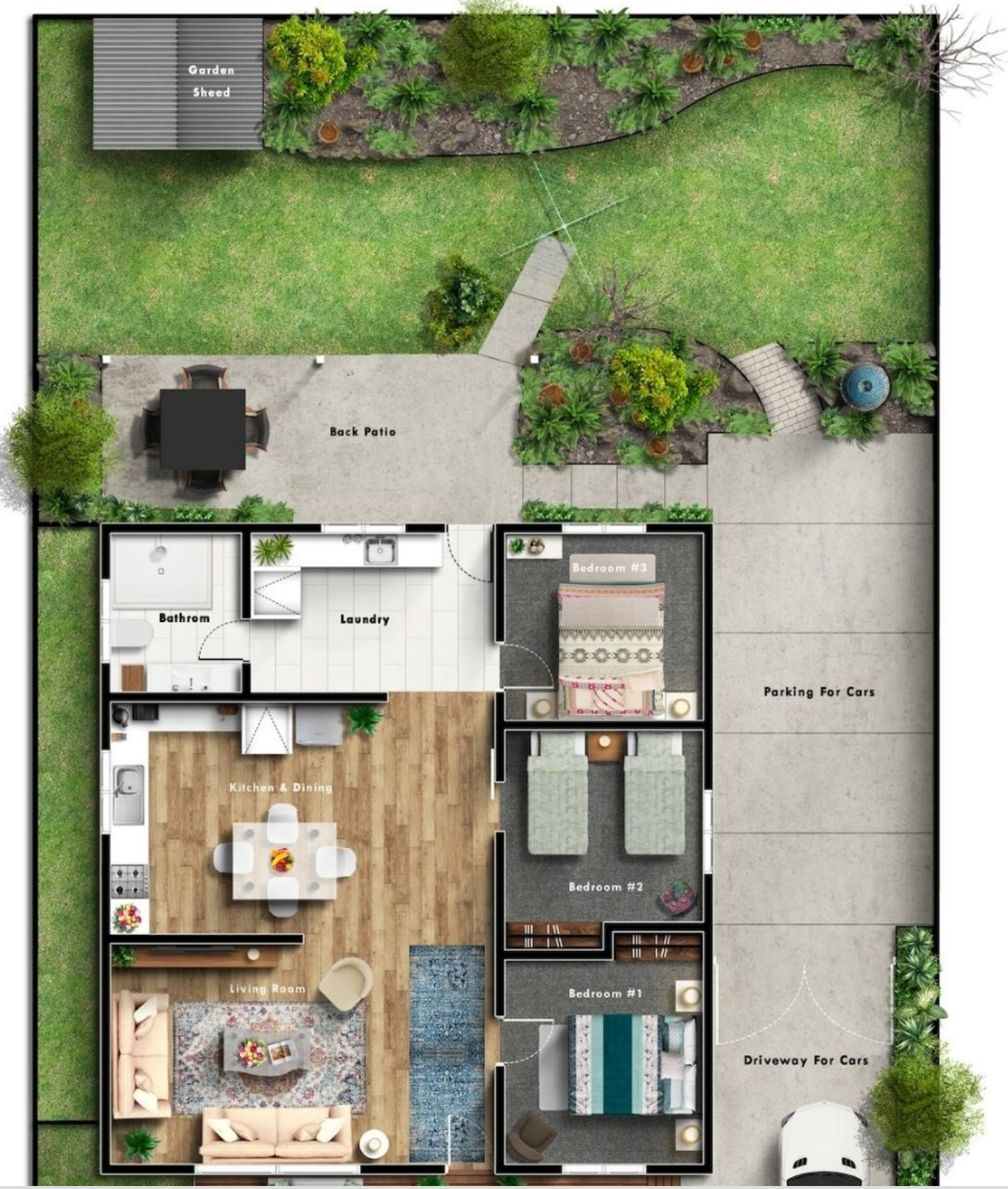
Disclaimer: Please note this floor plan is for marketing purposes and is to be used as a guide only. All dimensions are estimates only and may not be exact measurements.