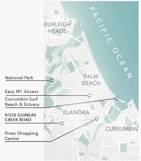
// LOCATION MAP

BEACHWOOD VILLAS 9/232 Guineas Creek Rd ELANORA