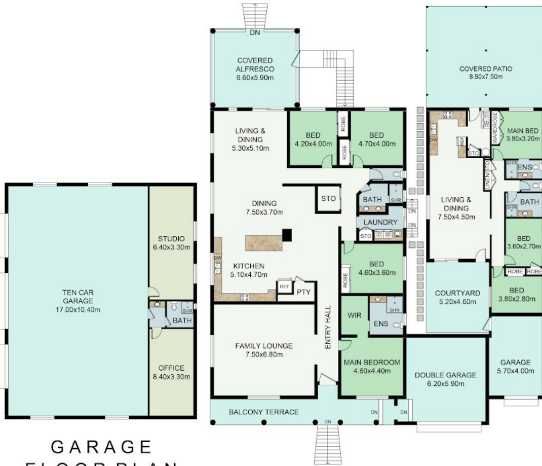
GARAGE FLOOR PLAN