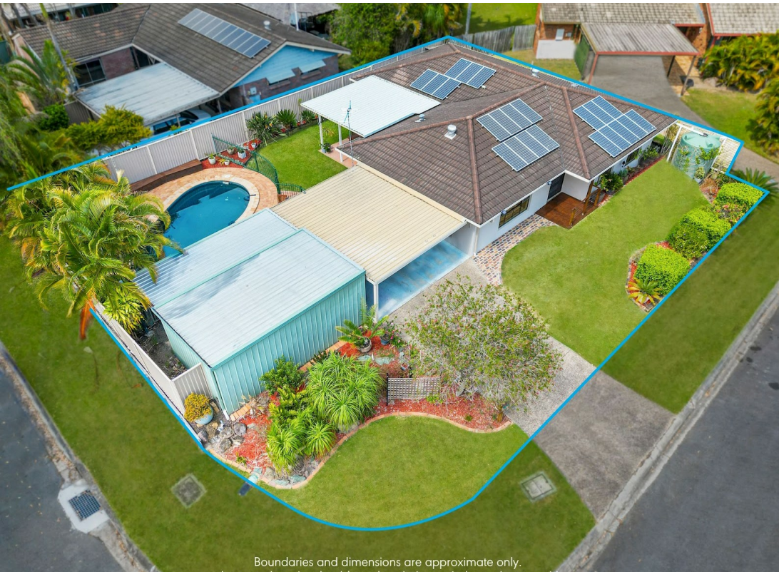
Boundaries and dimensions are approximate only.