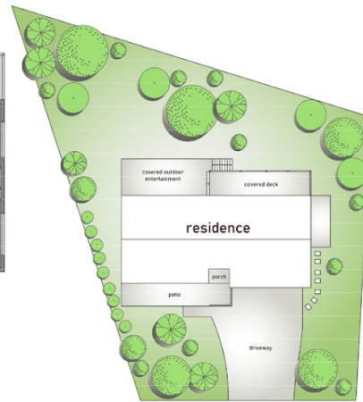
Coomburra Crescent site plan