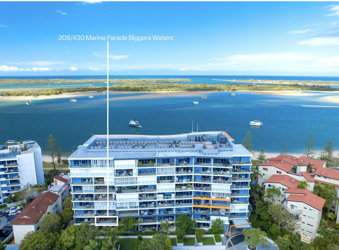
208/430 Marine Parade Biggera Waters