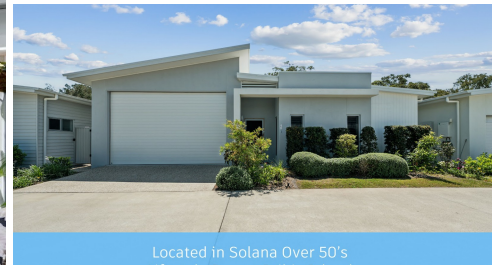
Located in Solana Over 50's