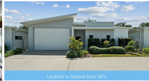
Located in Solana Over 50's