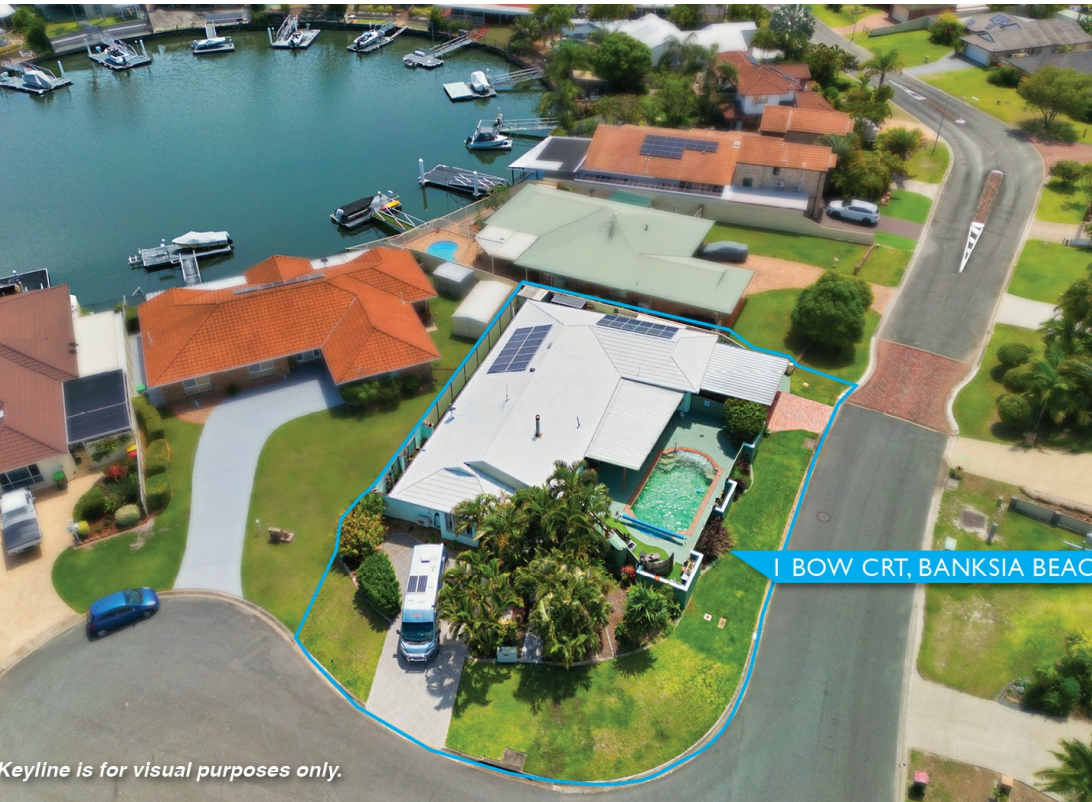
Keyline is for visual purposes only.