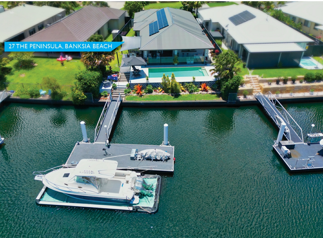
27 THE PENINSULA, BANKSIA BEACH