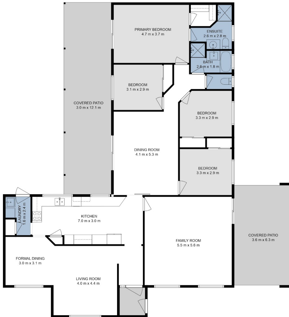
This floor plan is intended to give a general indication of the layout only. Sizes & dimensions are approximate, actual may vary.