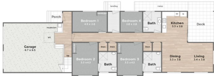
:: GROUND FLOOR