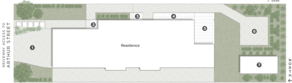
:: SITE PLAN