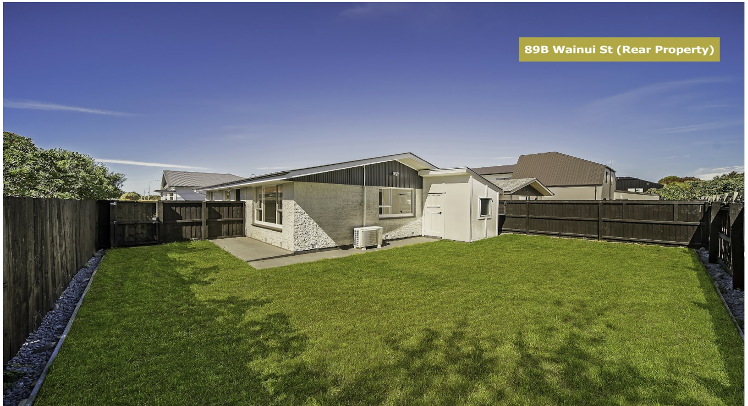
89B Wainui St (Rear Property)