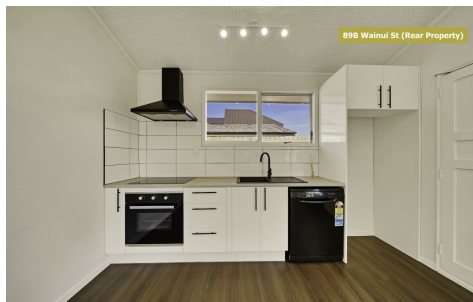
89B Wainui St (Rear Property)