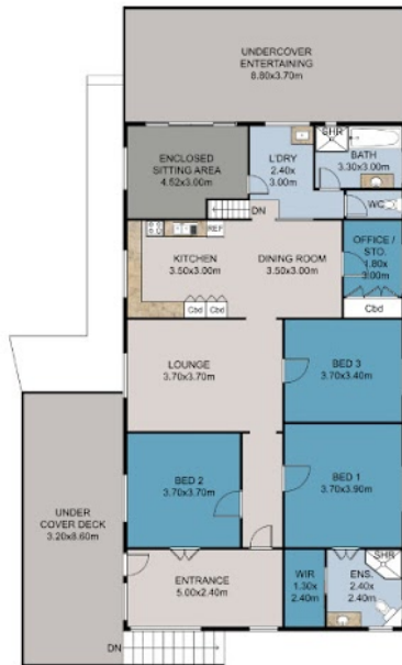
GROUND LEVEL PLAN