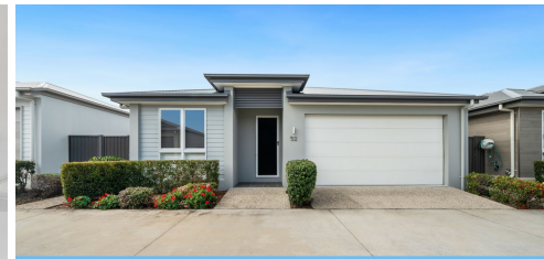
Located in GemLife Over 50's