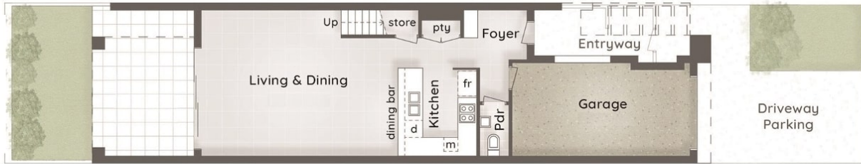
:: FLOOR PLAN Ground Floor - 2.7m Ceiling