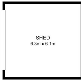
SHED 6.3m x 6.1m