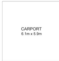
CARPORT 6.1m x 5.9m