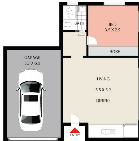
MID LEVEL 67.5m 2 (approx.) 1 Bedroom Flat