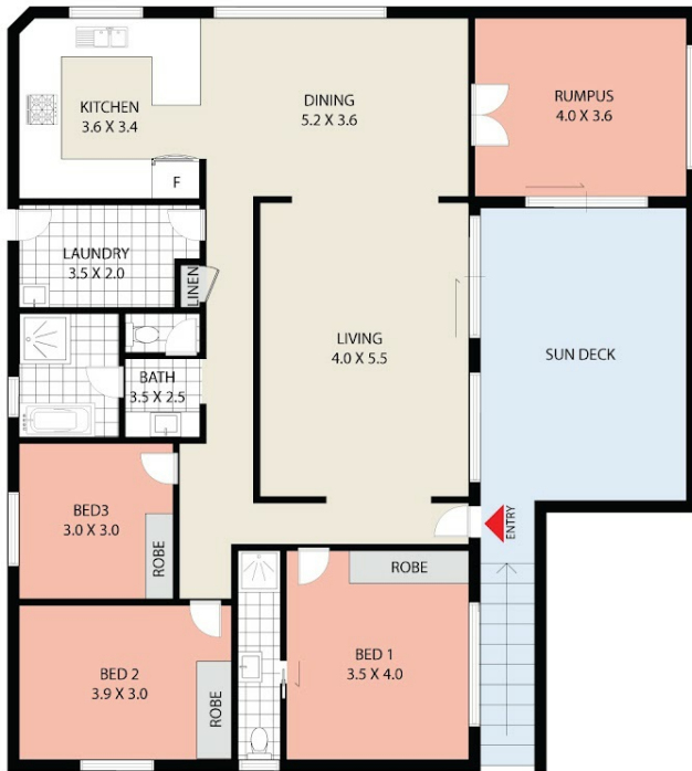
TOP LEVEL 135.4m 2 (approx.)