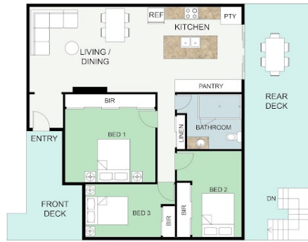
TOP FLOOR PLAN