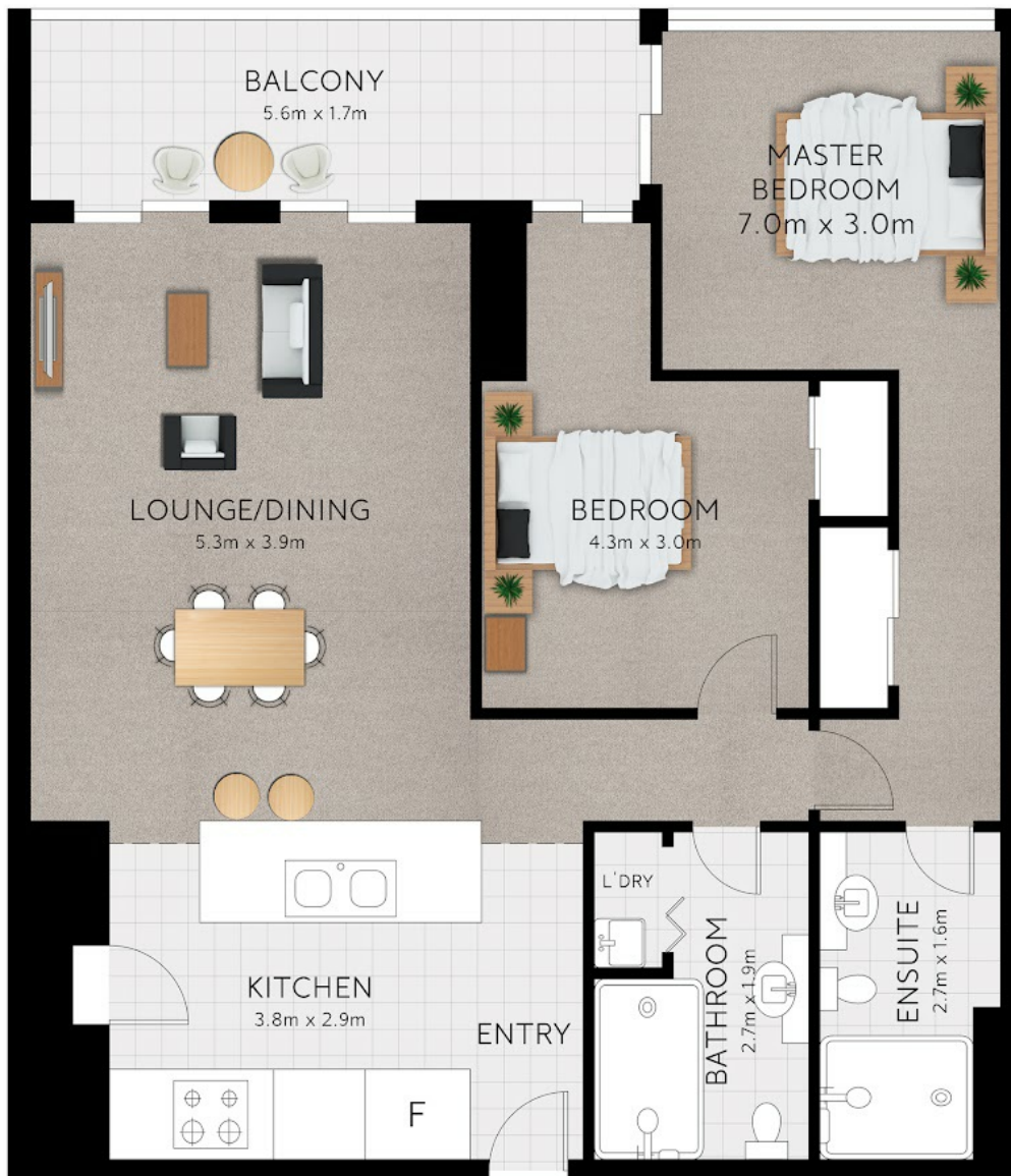
APARTMENT TYPE D