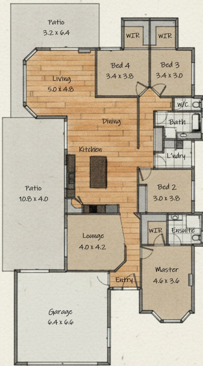
162 Forest Ridge Drive, Narangba 4 Bed | 2 Bath | 2 Car | 900sqm Block | 283sqm Under Roof