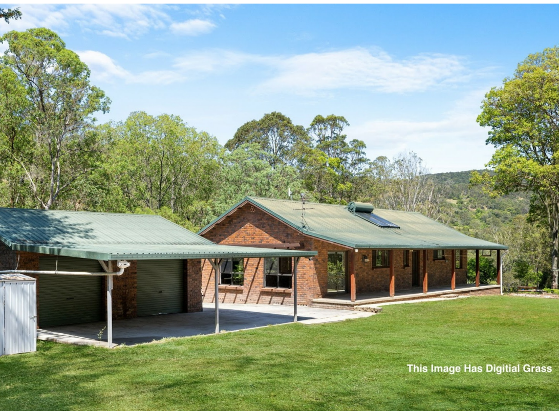
This Image Has Digital Grass