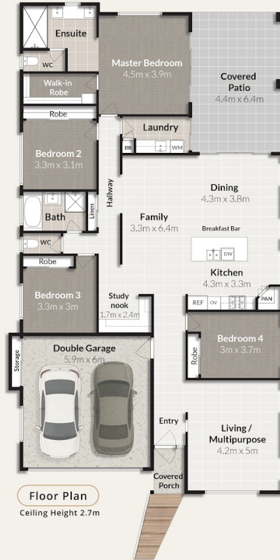
Floor Plan Ceiling Height 2.7m

Whilst every effort has been undertaken for 300% accuracy, Plans should not be relied on solely. All measurements are for illustrative purposes only and are intended to depict the general layout. Only No plans/site plans represented are to scale. Areas have been rounded off where appropriate. Area calculations are based on third party calculations. Unauthorised use or modification of this plan is strictly prohibited without the explicit consent of Envisual Design.