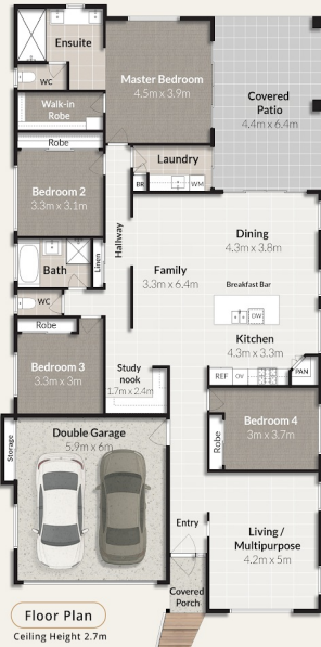
Floor Plan Ceiling Height 2.7m

ENVISUAL DESIGN has been undertaken for 2020 compliance. Plans should not be used for construction until all requirements are met. For further information, please contact the architect or the relevant authority. No part of this plan should be used to build. Areas have been indicated in green. All dimensions are based on internal party walls. Measurements are approximate and subject to change. All areas are indicated in green. All areas are indicated in green. All areas are indicated in green.